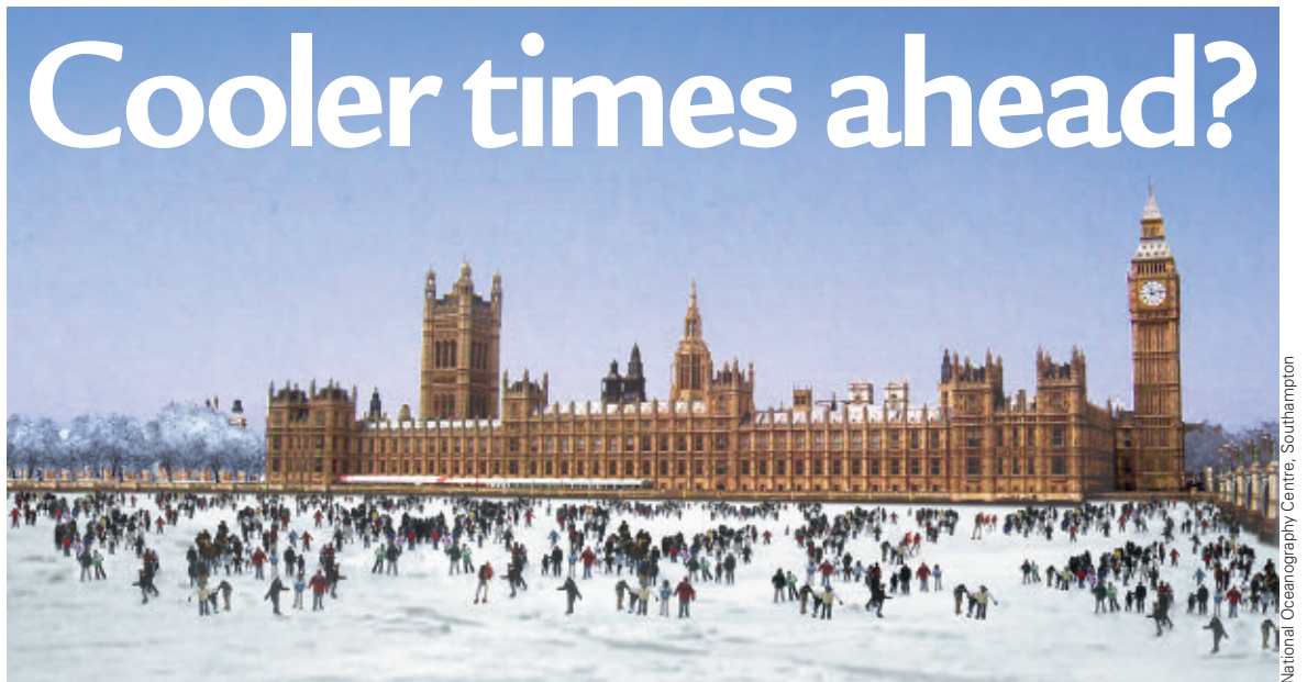
National Oceanography Centre, Southampton

Right: This image of people skating on the frozen Thames represents a potential, if highly unlikely, future scenario